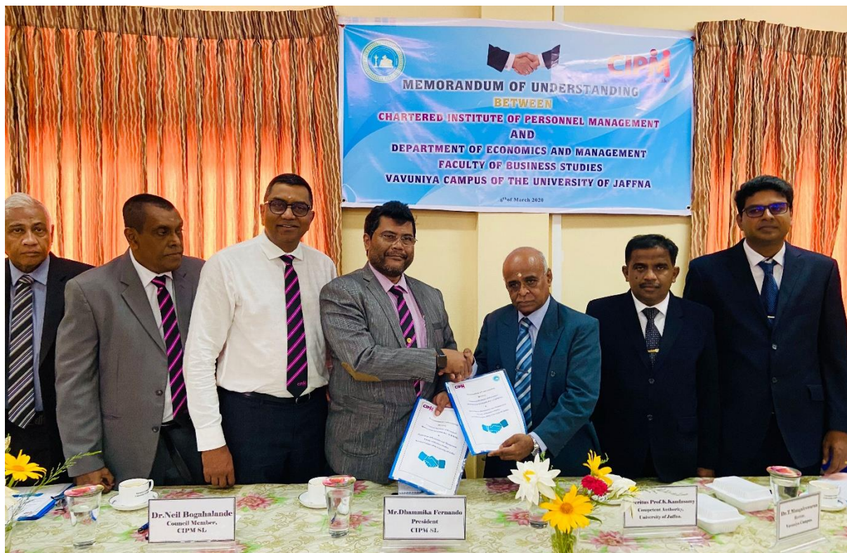
Memorandum of Understanding between The Chartered Institute of Personnel Management Sri Lanka & Department of Economics and Management Faculty of Business Studies Vavuniya Campus of the University of Jaffna

The academic and professional collaboration between CIPM and the Vavuniya campus, University of Jaffna will extend to collaborative research on HRM topics