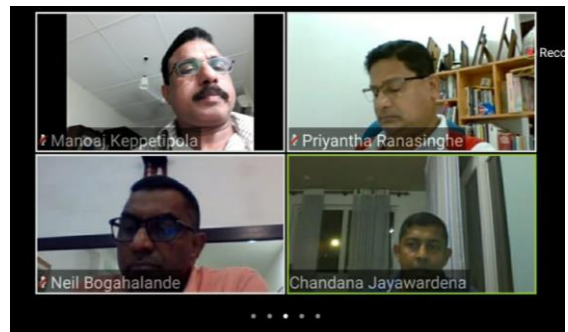
CIPM Board room and some of the screen shots of the virtual meeting of CIPM held on 18 Mar 20, amidst global Corona pandemic